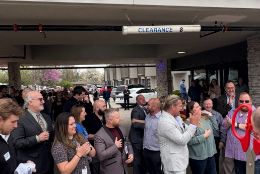
Avalon Ribbon Cutting