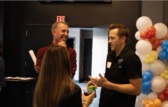
New Member Reception