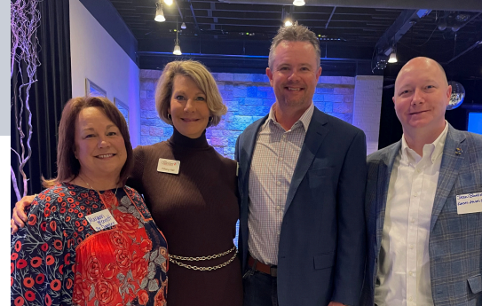
Downtown Lawrence Inc. Breakfast