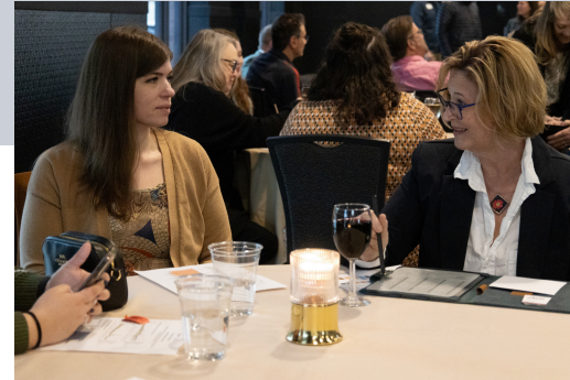
Hospitality Sector Meeting