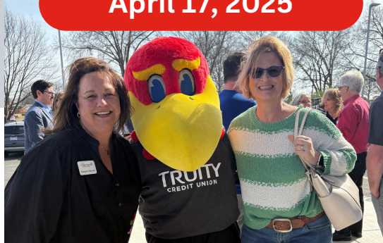
Truity Credit Union Grand Opening