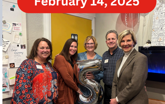
Uplift Coffee 5th Birthday Celebration