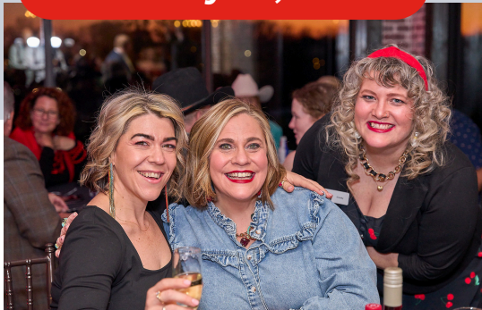
Annual Meeting 2025