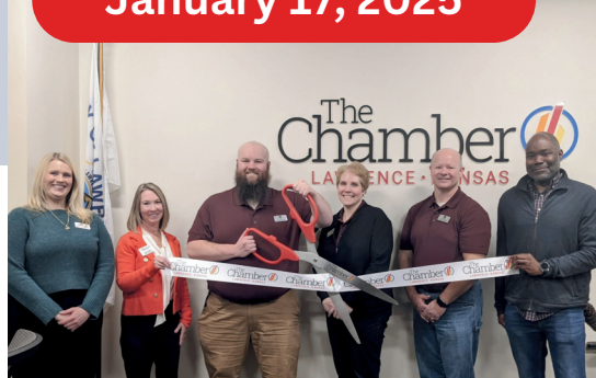
Signature Cleaning Ribbon Cutting