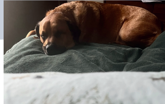
Jared Martin - Snow Picture