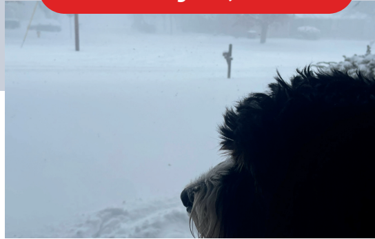
Margann Bennett - Snow Picture