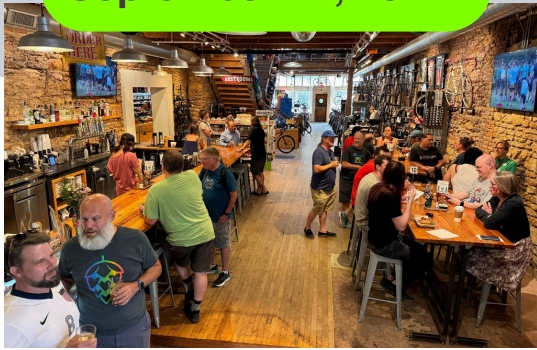
Tech Guild meetup for August