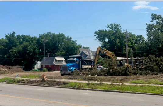
Construction underway on developer Krsnich's New Hampshire project