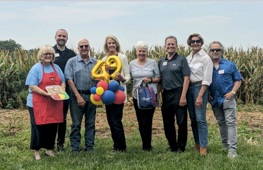
Chamber Cares: Nunemaker-Ross, Inc. celebrates 49 years Chamber Anniversary