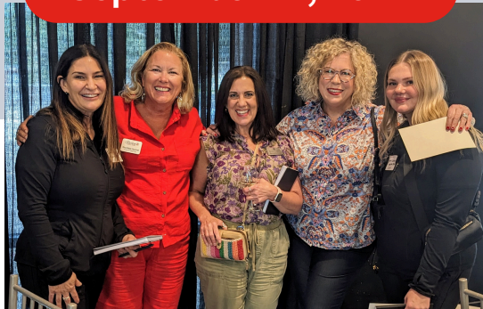
New Member Reception, held at Maceli's Banquet Hall