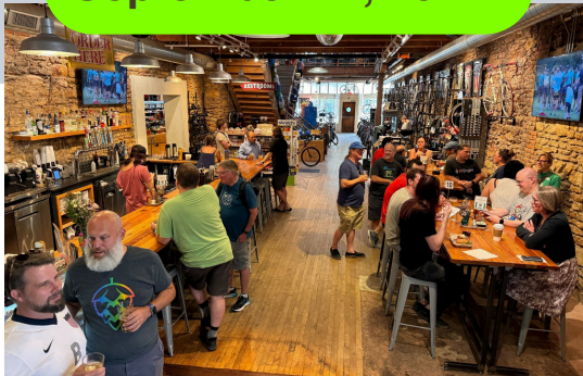
Tech Guild meetup for August