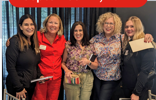
New Member Reception, held at Maceli's Banquet Hall