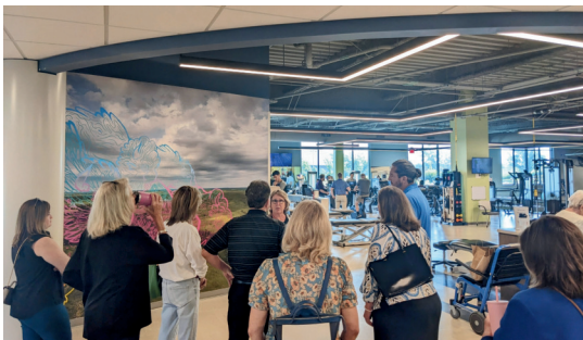
EDC Tour of LMH West