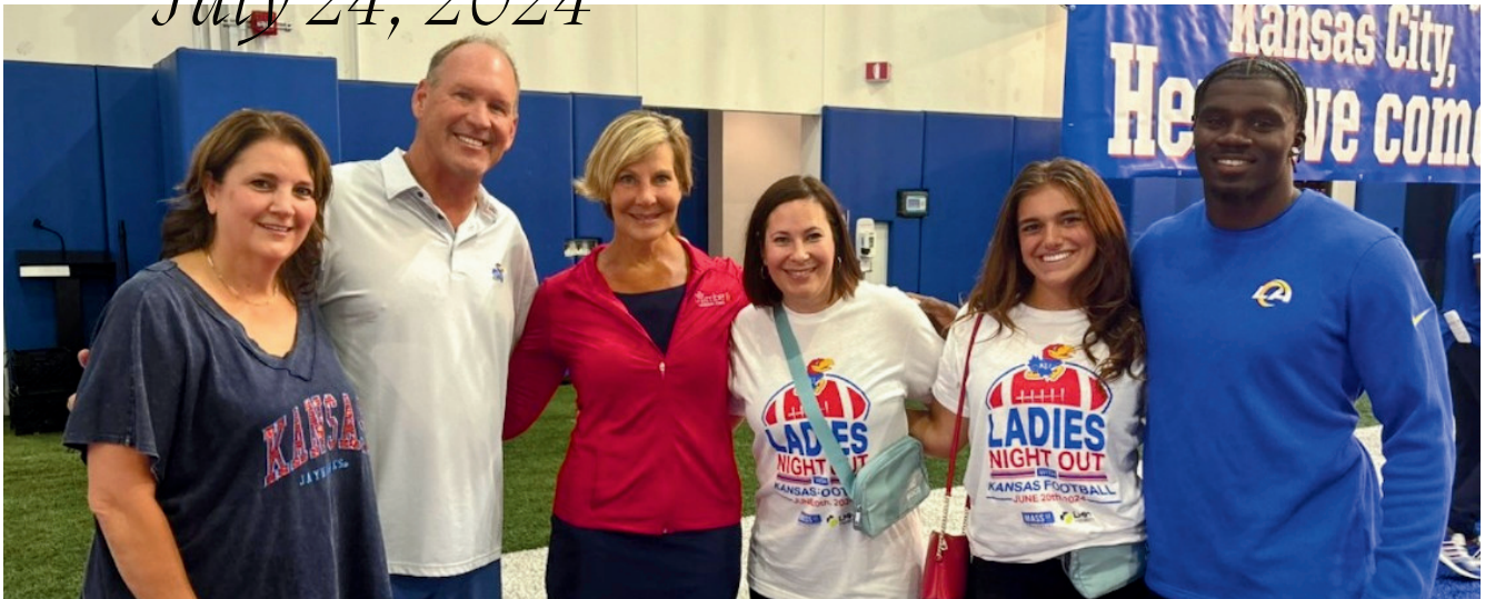
Ladies Night Out - Mass St. Collective and Kansas Football