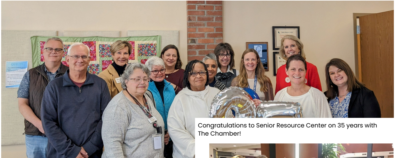
Congratulations to Senior Resource Center on 35 years with The Chamber!